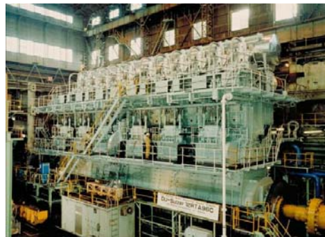
A Typical Wärtsilä Ship Engine

Wärtsilä Corporation is a leading global ship power supplier, and a major provider of solutions for decentralized power generation. Headquartered in Finland, with offices in 60 countries, and with revenues in excess of EUR 2.4 billion per year, Wärtsilä is a leader in the application of technology to marine engine design.