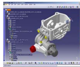
Model deliverable to customer in CATIA v5